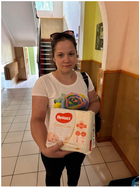
Aid to young mums