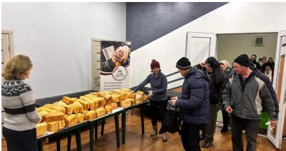
Bread distribution after Sunday service