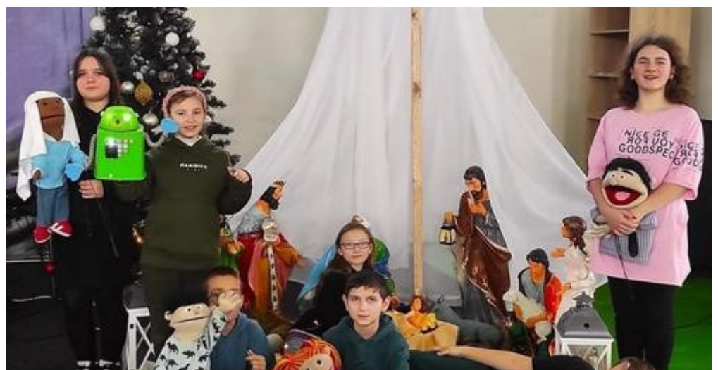
Christmas camp 2023 with puppet ministry

For more information visit the website hopelebedyn.org